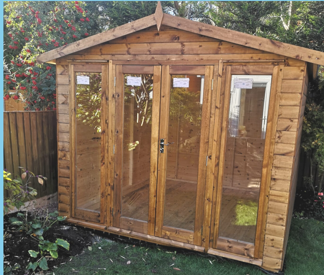
FULL LENGTH DOUBLE GLAZED