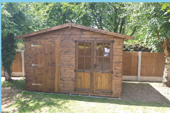
SHED / SUMMERHOUSE COMBI