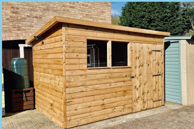
DRIVEWAY PENT SHED