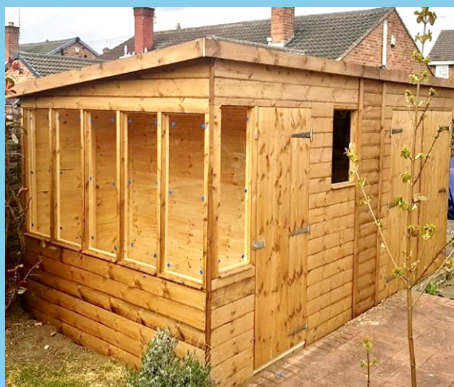
PENT POTTING SHED