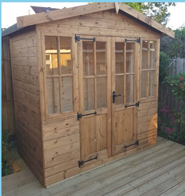
SMALL GEORGIAN SUMMERHOUSE