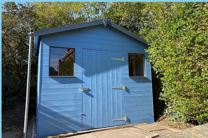
PAINTED APEX SHED