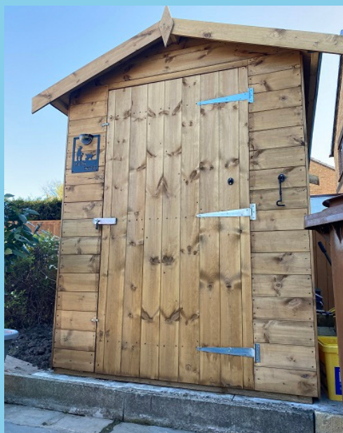
FUNCTIONAL APEX SHED