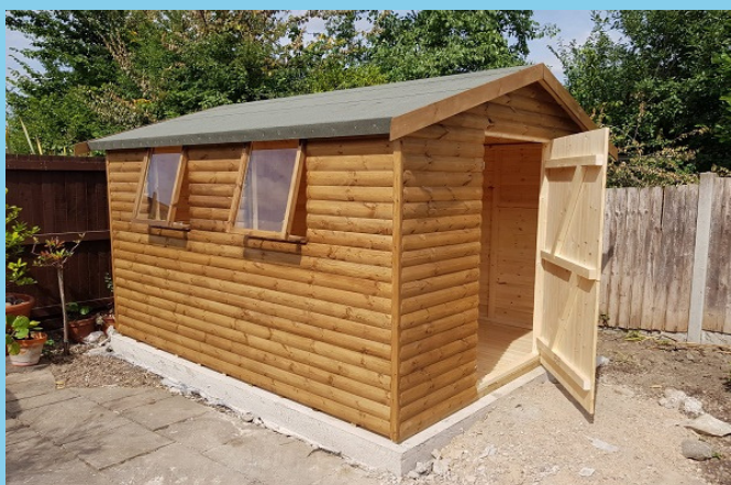
APEX SHED IN LOGLAP CLADDING