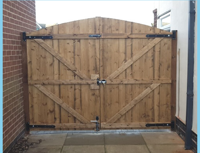
Single and double gates