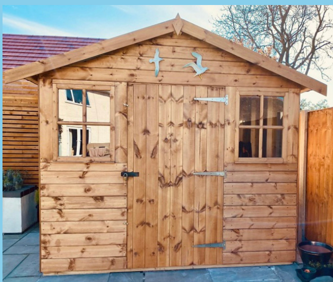
APEX SHED WITH GEORGIAN WINDOWS